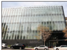
Eli and Edythe Broad CIRM Center for Regenerative Medicine and Stem Cell Research (BCC)