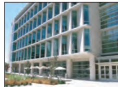
Zilkha Neurogenetic Institute (ZNI)