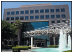
Healthcare Consultation Center (HCC)

On-call and Patient Trams operate Monday through Friday via a contracted transportation service. Call USC Transportation at (213) 740-3575 for more information.