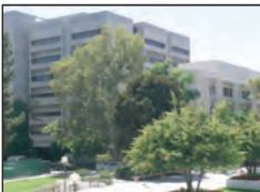
Stauffer Pharmaceutical Sciences Center (PSC)