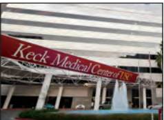
Keck Hospital of USC (UNH)