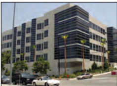
Healthcare Consultation Center II (HCT)